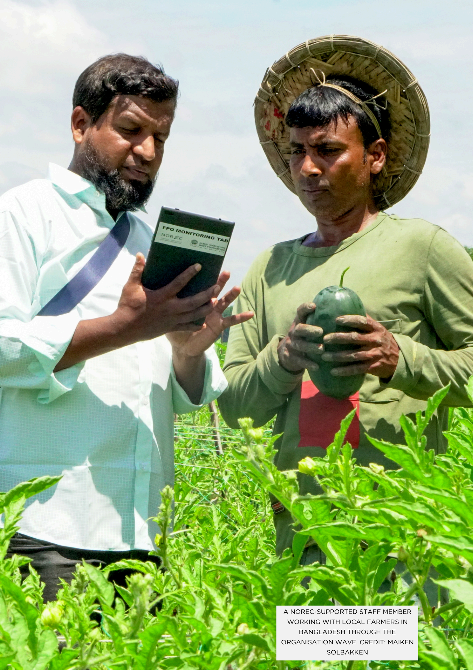
A NOREC-SUPPORTED STAFF MEMBER WORKING WITH LOCAL FARMERS IN BANGLADESH THROUGH THE ORGANISATION WAVE.